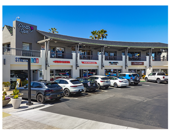
Beachwalk Shopping Center totals 55,580 square feet in Solana Beach, California.